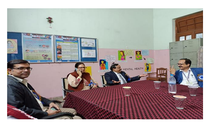
Annual Sports 2023