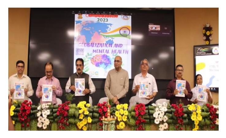
Foundation Day 2023