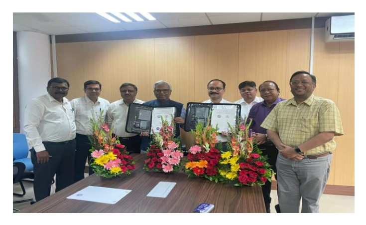
MoU between CIP & RIMS 2023