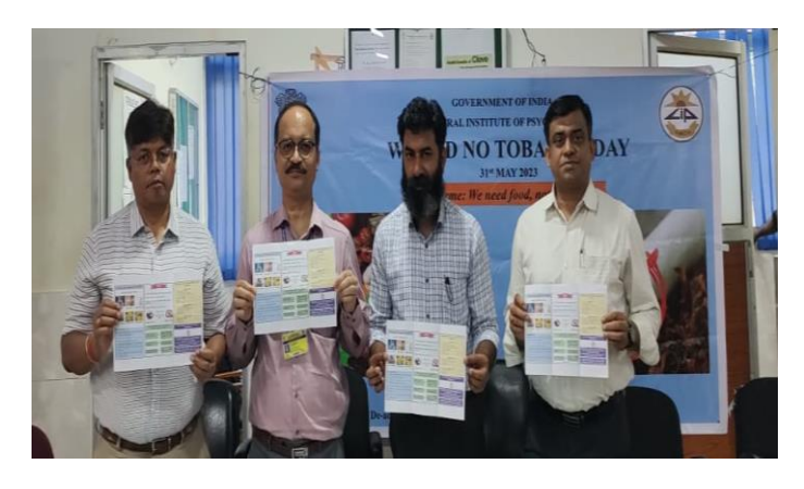
World No Tobacco Day 2023