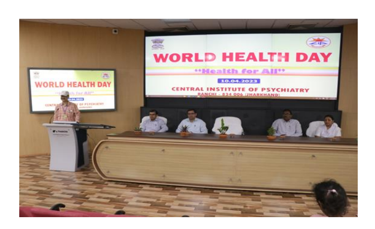
World Health Day 2023